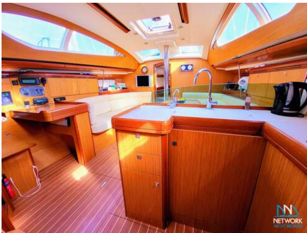
SUN ODYSSEY 42 DS 2 Double Cabin Owners Version