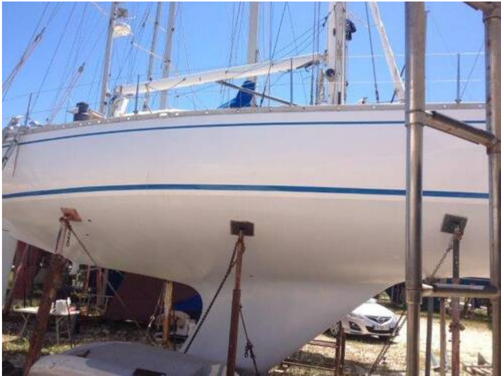
NAUTOR SWAN 41