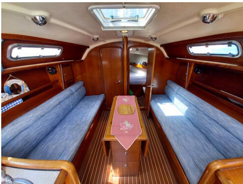
BAVARIA 34 (3 cabin)