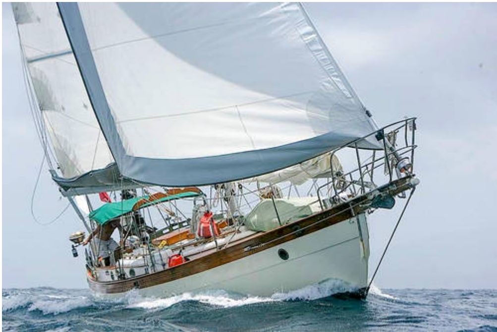
Hans Christian 43 T