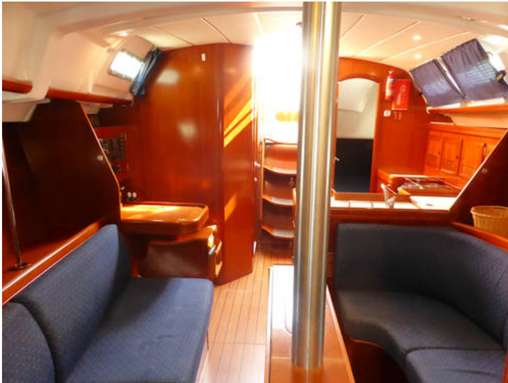
Beneteau Oceanis 373 Clipper Two Cabin (Owners version)