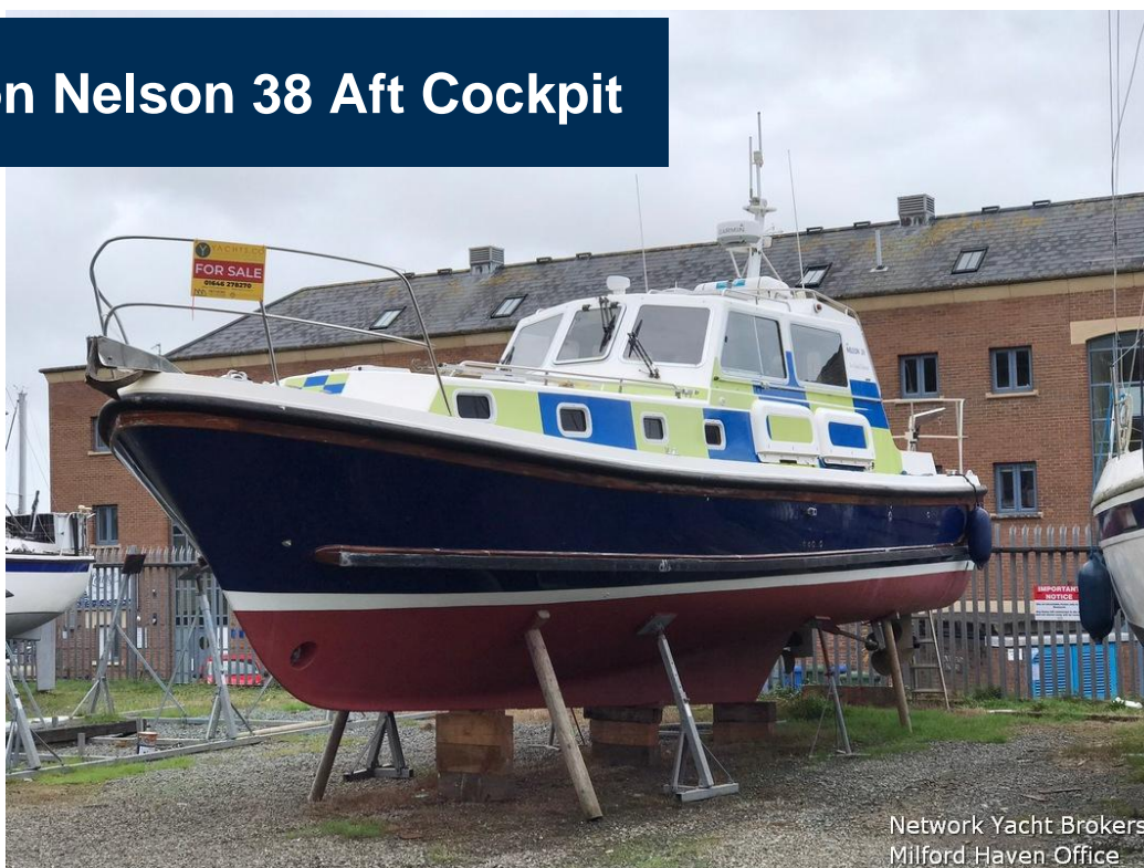
Network Yacht Brokers Milford Haven Office