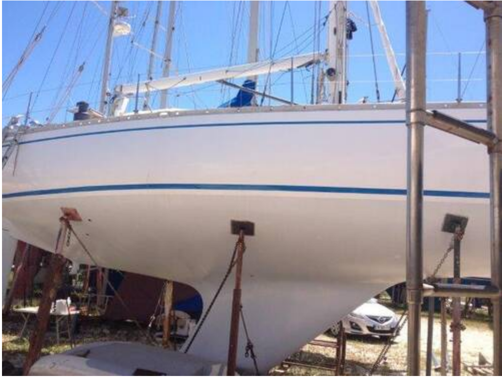
NAUTOR SWAN 41