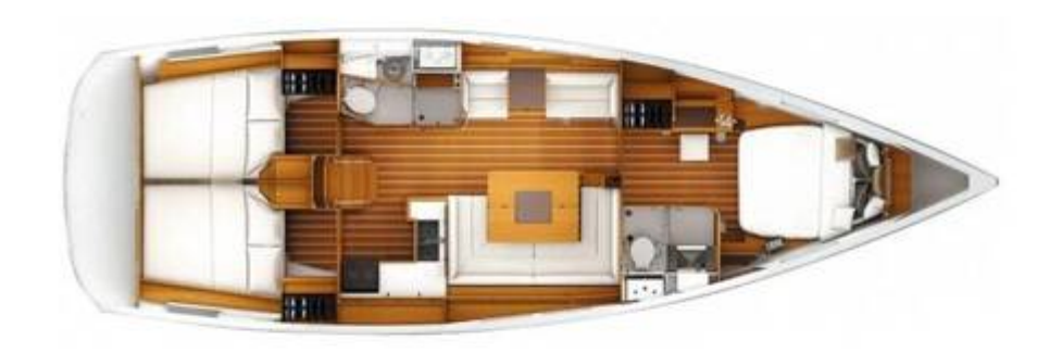
NETWORK YACHT BROKERS