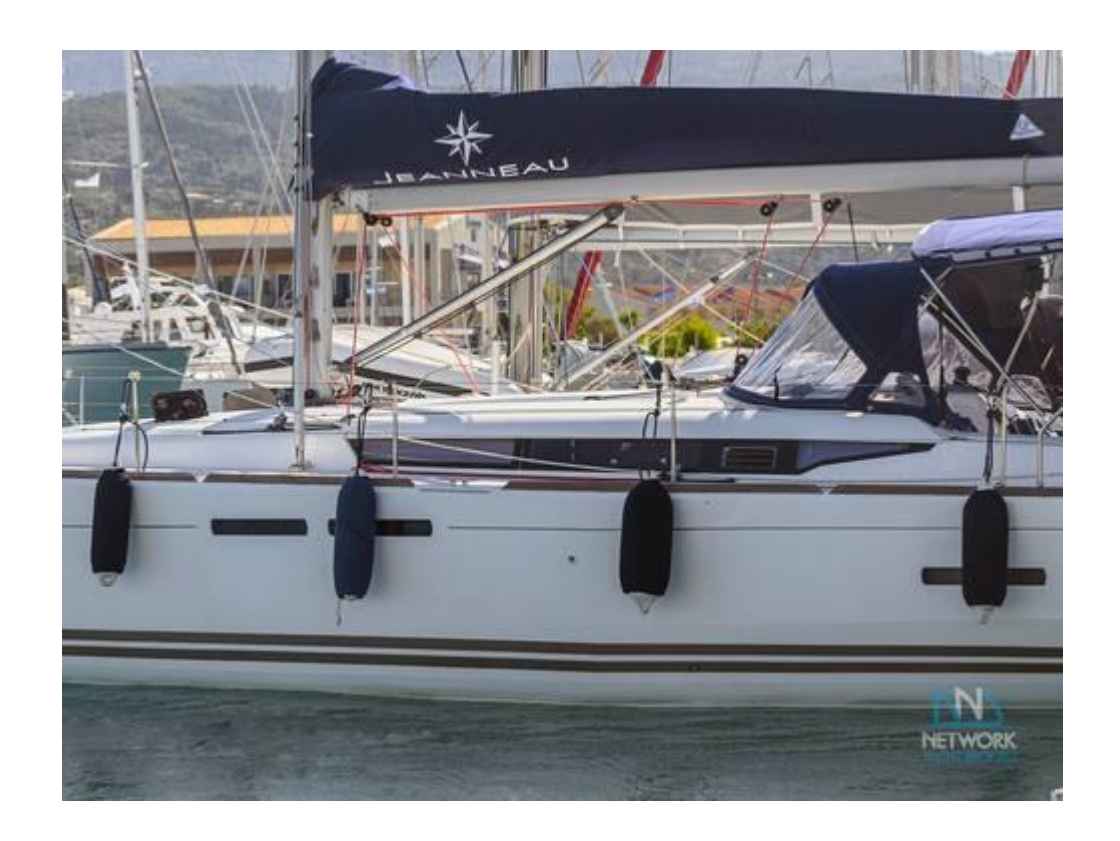
Jeanneau Sun Odyssey 439 3 cabins - 2 heads