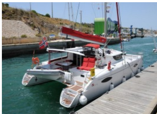
Fountaine Pajot Orana 44 Maestro Version