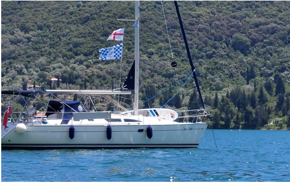
Jeaneau Sun Odyssey 37 (Owners 2 cabin version)