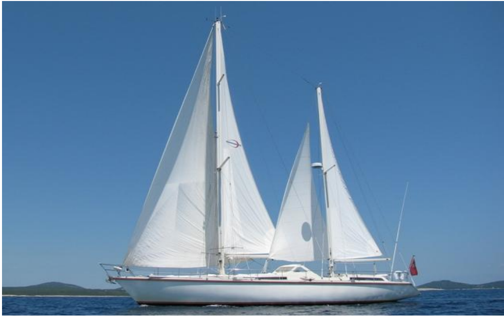
AMEL SUPER MARAMU