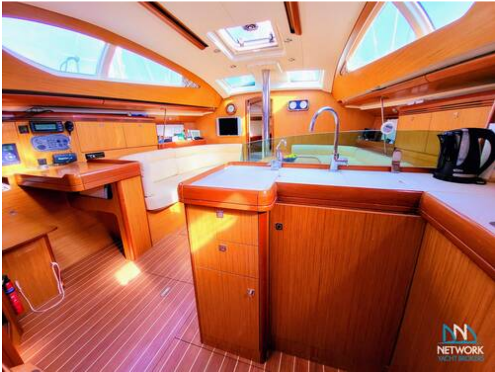
SUN ODYSSEY 42 DS 2 Double Cabin Owners Version