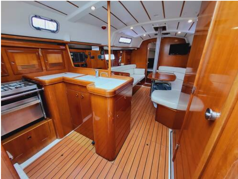
BENETEAU OCEANIS 361 2 Cabin version