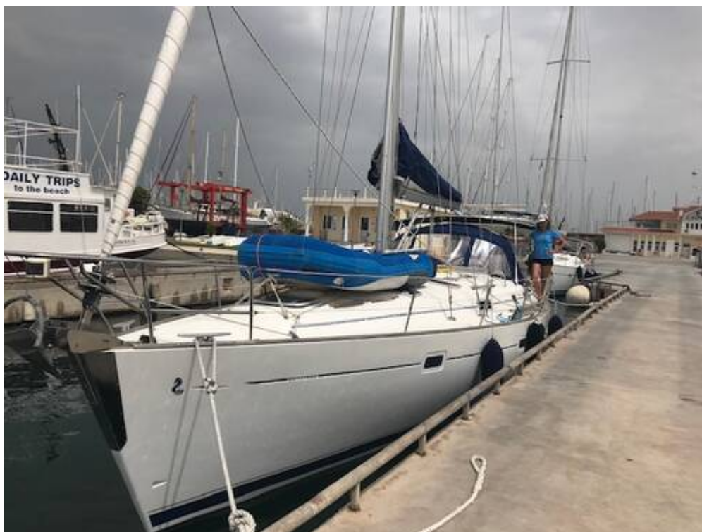
BENETEAU OCEANIS 411 CELEBRATION