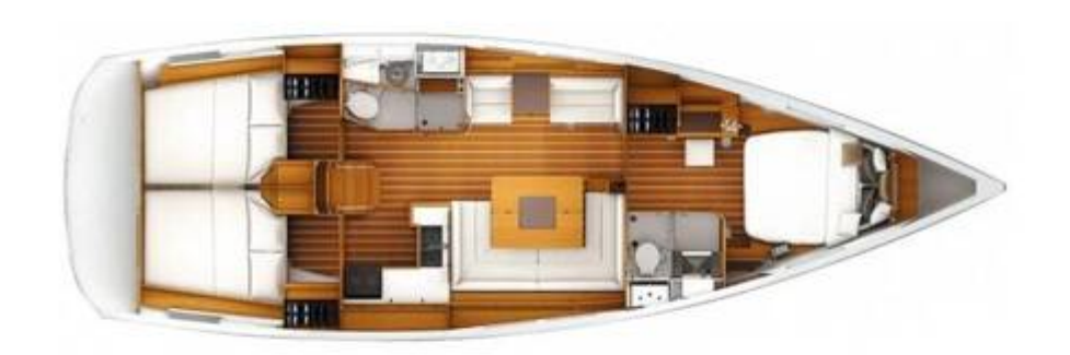
NETWORK YACHT BROKERS