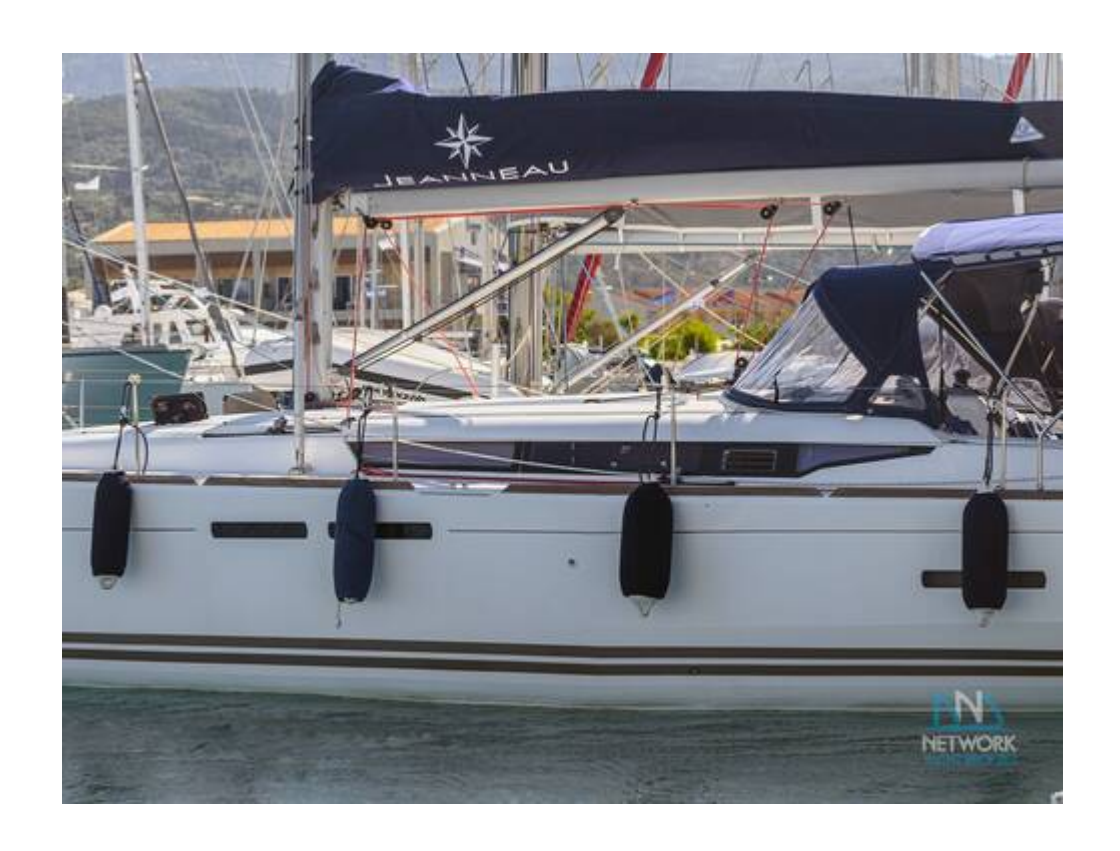
Jeanneau Sun Odyssey 439 3 cabins - 2 heads