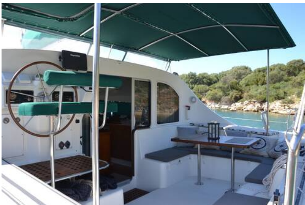
Lagoon 410 ( Four doubles two heads ensuite)