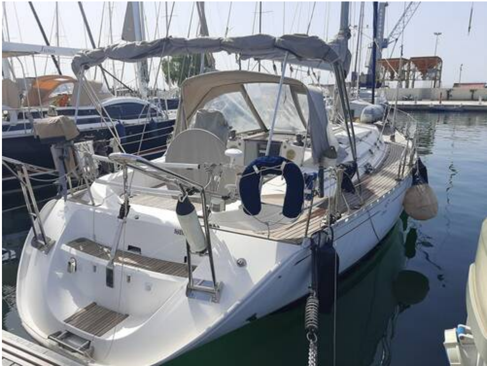
DUFOUR 43 Classic