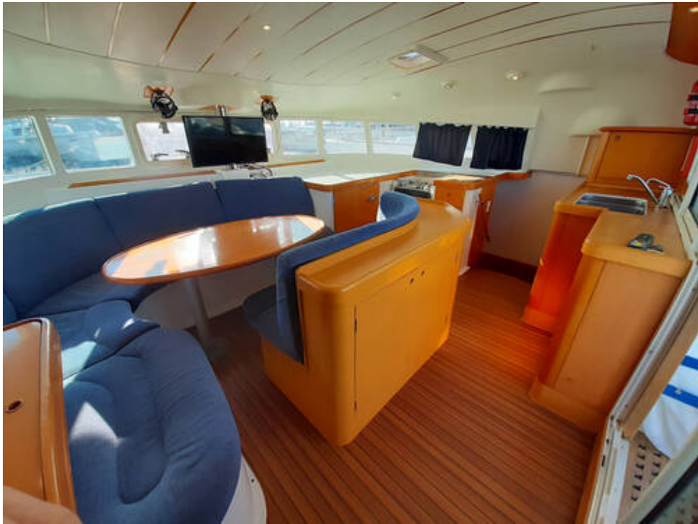
LAGOON 410 S-2