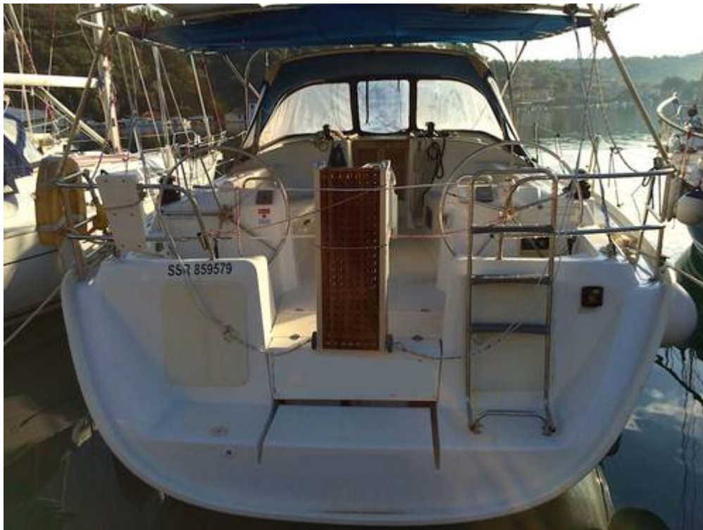
Beneteau Cyclades 43 Network Yacht Brokers