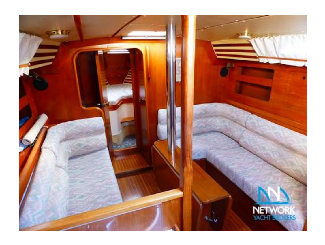
MOODY 376 CC IONIAN YACHT SALES